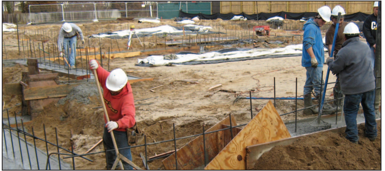
Workers pour the foundation at the southeast corner in mid-December.

Since our ground breaking in September, there has been a lot of progress on the new Library at 7 Library Avenue. You can now see the outline of the new building peeking