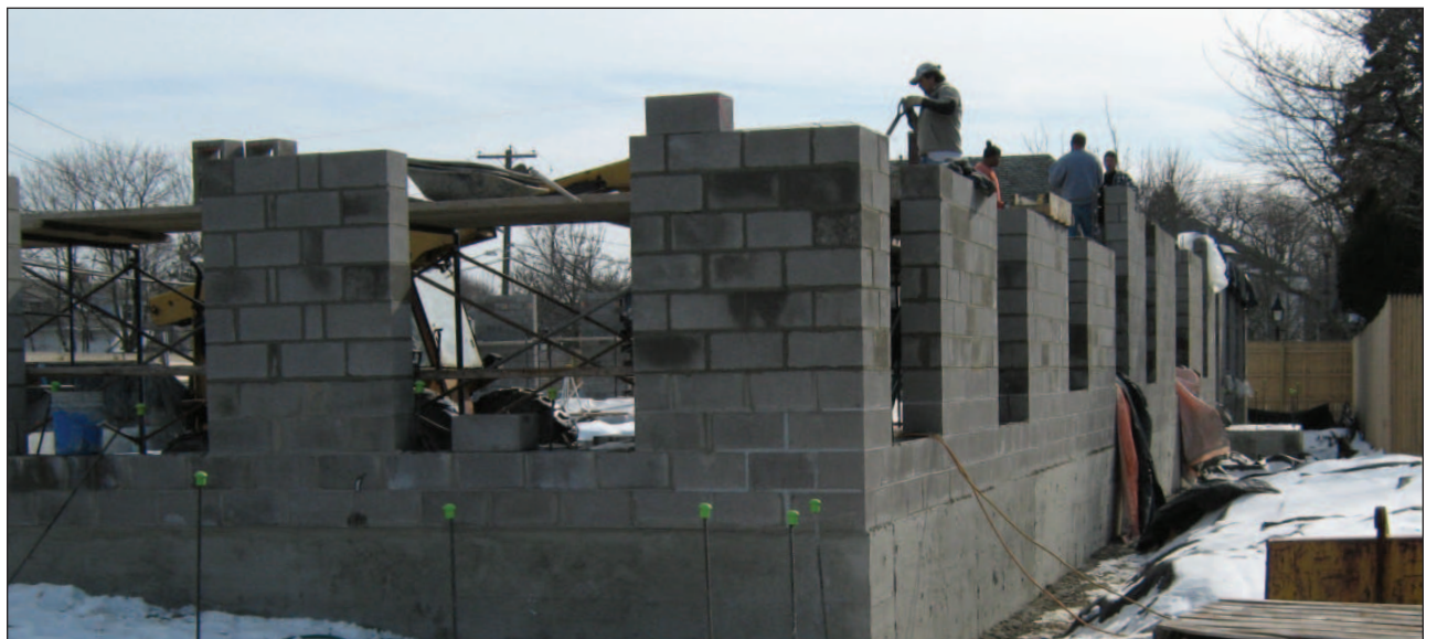
Block is being set to form the first floor walls in early February.